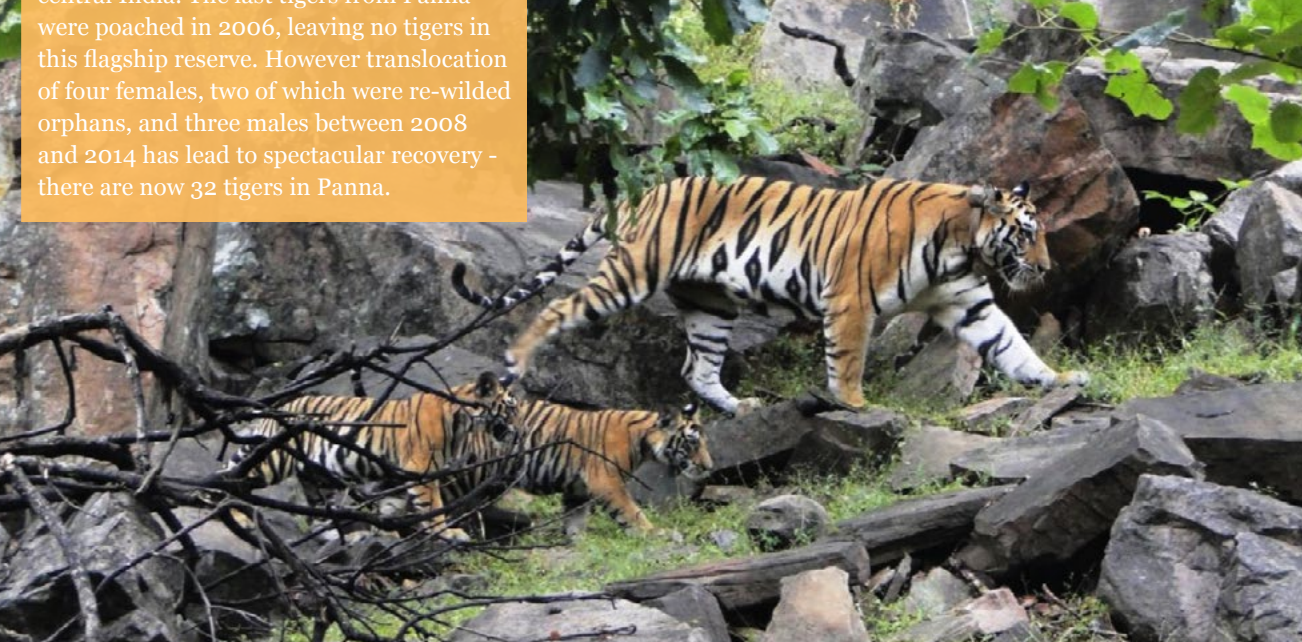
A reintroduced tigress with two cubs in Panna Tiger Reserve, India

The Eastern Plains Landscape spans more than 30,000km<sup>2</sup> and includes four key protected areas in Cambodia and one in Vietnam.